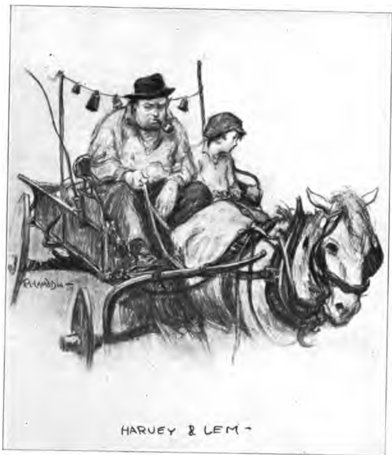
HARVEY & LEM -